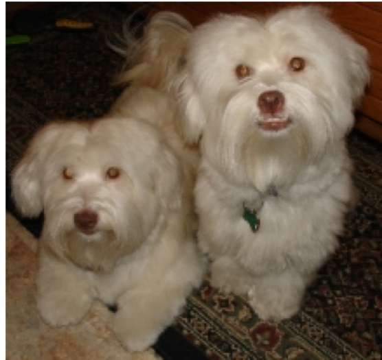
Nala and Simba

Hello everyone! Nala, here! My brother Simba and I would like to tell you a little bit about our lives now that we have found our furever home. We were happy to be adopted by a family of six. They didn't even know that they really wanted two dogs, until Simba and I came along.