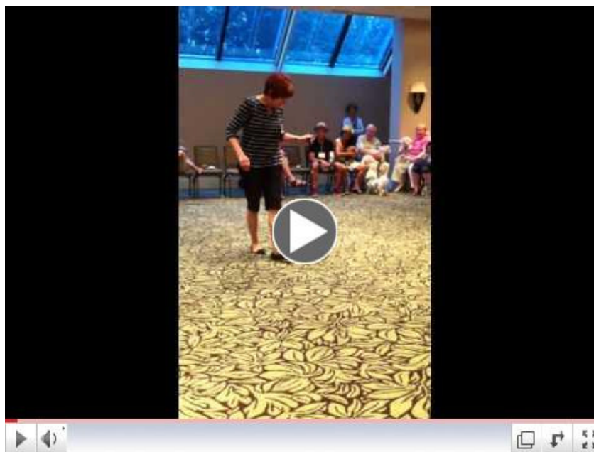
Havanese Rescue 2012 Parade

Yep, you guessed it -- there were a lot of people with "something in their eyes" at this year's Parade.